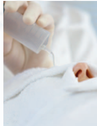
6. The peel is activated by the application of cold water.